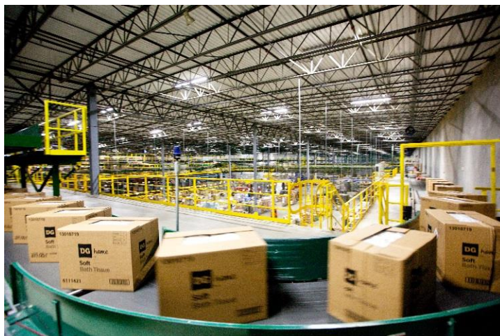
DOLLAR GENERAL DISTRIBUTION FACILITY IN MARION, IN

Dunham’s Athleisure Corporation invested over $20 million to expand its Marion, Indiana, distribution center to 732,000 square feet and an additional $12 million in new equipment, representing one of the largest economic development projects in Indiana for 2014.